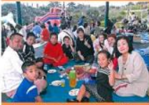
June Koho Okinawa Cover Photo

"Eating with family makes everything taste better!"