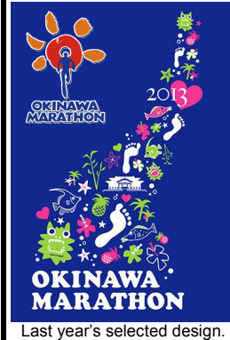
Last year's selected design.

The Okinawa Marathon Executive Committee is looking for next year's Okinawa Marathon commemorative t-shirt design.