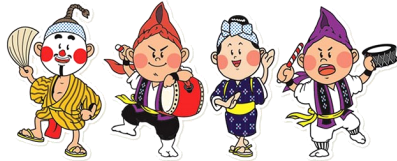
(EISA, Okinawa Prefecture 1998)

The Bon Festival is celebrated from the 13th to the 15th of the seventh lunar month. During the Bon Festival, incense and meals are offered to the ancestral spirits. Although Eisa can be heard all throughout the Bon Festival, it was usually performed on the night of the 15th until the next day to let the spirits know that it was time for them to go back to their world until next year. This year, OBON in Okinawa will be observed on August 19, 20 and 21.