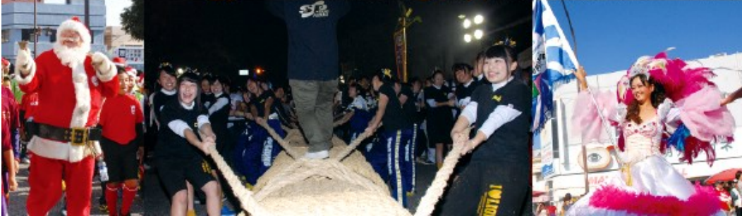
"The Contest of Cultures" The Okinawa International Carnival was held on November 30 and December 1 with the Gate 2 Parade as the main attraction. Visitors enjoyed the parade, tug-of-war, bike parade, and the colorful international culture.