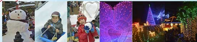
● The park of snow Let's play Sled and Snowball.