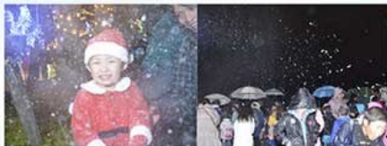
● Snow show Snow in Okinawa! 17:30 ~ / 19:15 ~ / 20:40 ~