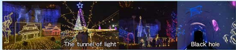
The tunnel of light