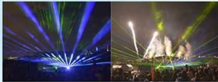
● Attraction of Super laser beam It's the biggest laser beam show in Okinawa.That's luxurious and fantastic