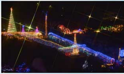
● The hill of million dollars you can see beautiful illuminations at here.for lovers...