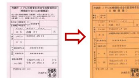
Pink (old) Orange (new)

Contact: Kodomo Katei Ka (Children's Welfare Division) Ext.2124/2125/3189