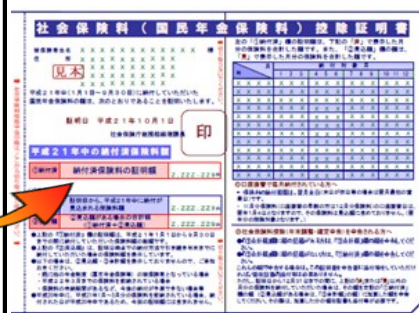
Inside the post card

The post card on the left column will be mailed to you from the Japan Pension Service during the following months: