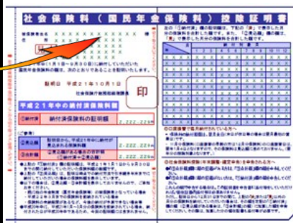
Inside the post card

The post card on the left column will be mailed to you from the Japan Pension Service during the following months: