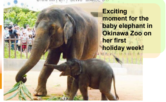
Exciting moment for the baby elephant in Okinawa Zoo on her first holiday week!