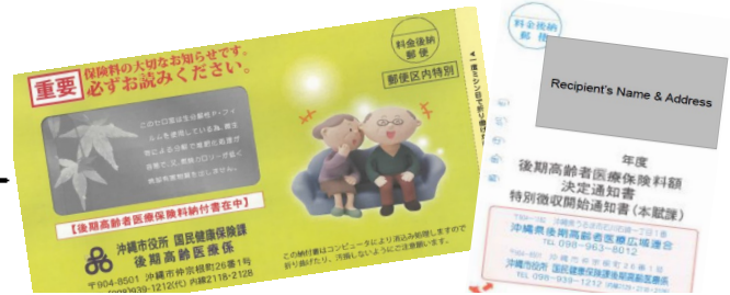
《保険料算定の基礎》 Premium Amount Calculation Formula