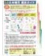
Blue envelope includes checkup coupon (varies by age) & guidebook