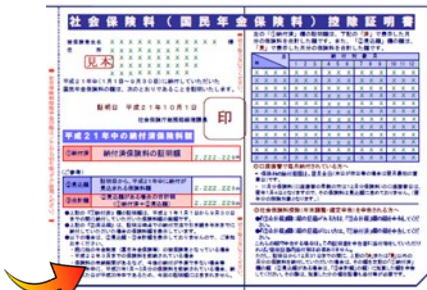
Inside the post card

will be mailed to you from the Japan Pension Service during the following months: