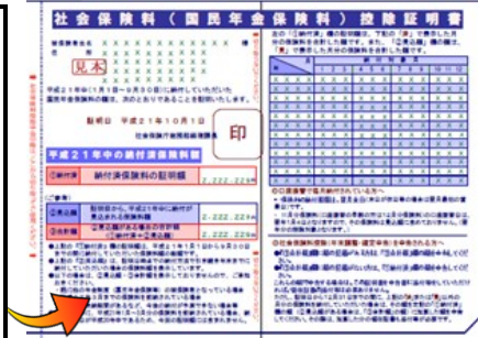
Inside the post card

will be mailed to you from the Japan Pension Service during the following months: