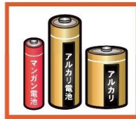
Battery (only Alkaline and manganese)